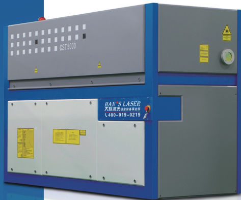
CST5000二氧化碳激光器 CST5000 CO 2 Laser Machine